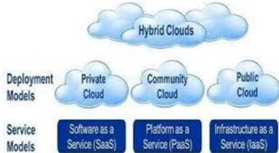
Fig.1 Deployment models and service models of the cloud computing