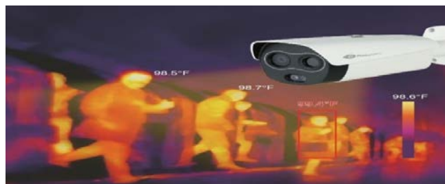
Fig.3 Body temperature sensing thermal camera