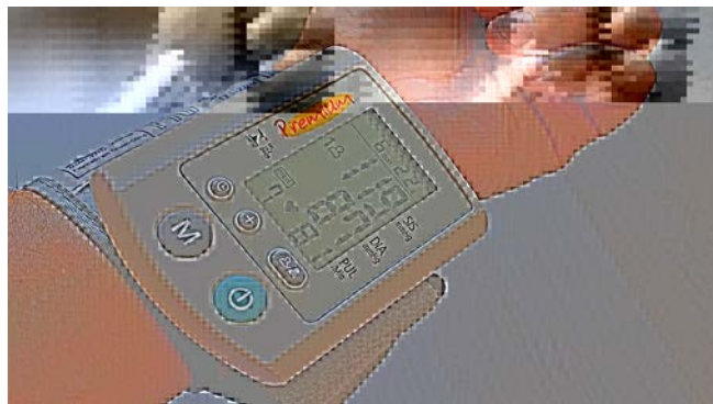
Fig.5 Wearable smart device to check blood pressure

to patients. This data is accessible in real time hence helping the medical staff to take decisions in a short amount of time mostly in case of emergencies.