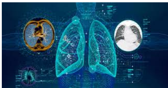
Fig. 2 AI-tool-predicts-which-covid-19-patients-can-develop-severe-respiratory-disease

Deep learning one of the sub-branch of AI can be used to learn patterns and predict the outcome based on training data, this requires access to larger data sets, for example, sufficient amounts of behavioral, social, clinical, airline, and other data sources of sufficient quality are required to build and train accurate enough machine-learning models of an outbreak's likely evolution path. In such a situation NLP can be handy to look for relevant reports coming from news outlets and official health care channels in different languages around the world. AI with Big data can make a radical shift in how we have approached to treat Pandemics in past.